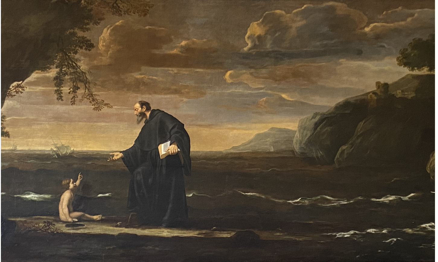
Marine Landscape with St Augustine: Joos de Momper (1564 – 1635), in the Museo dei Barocco, Ariccia