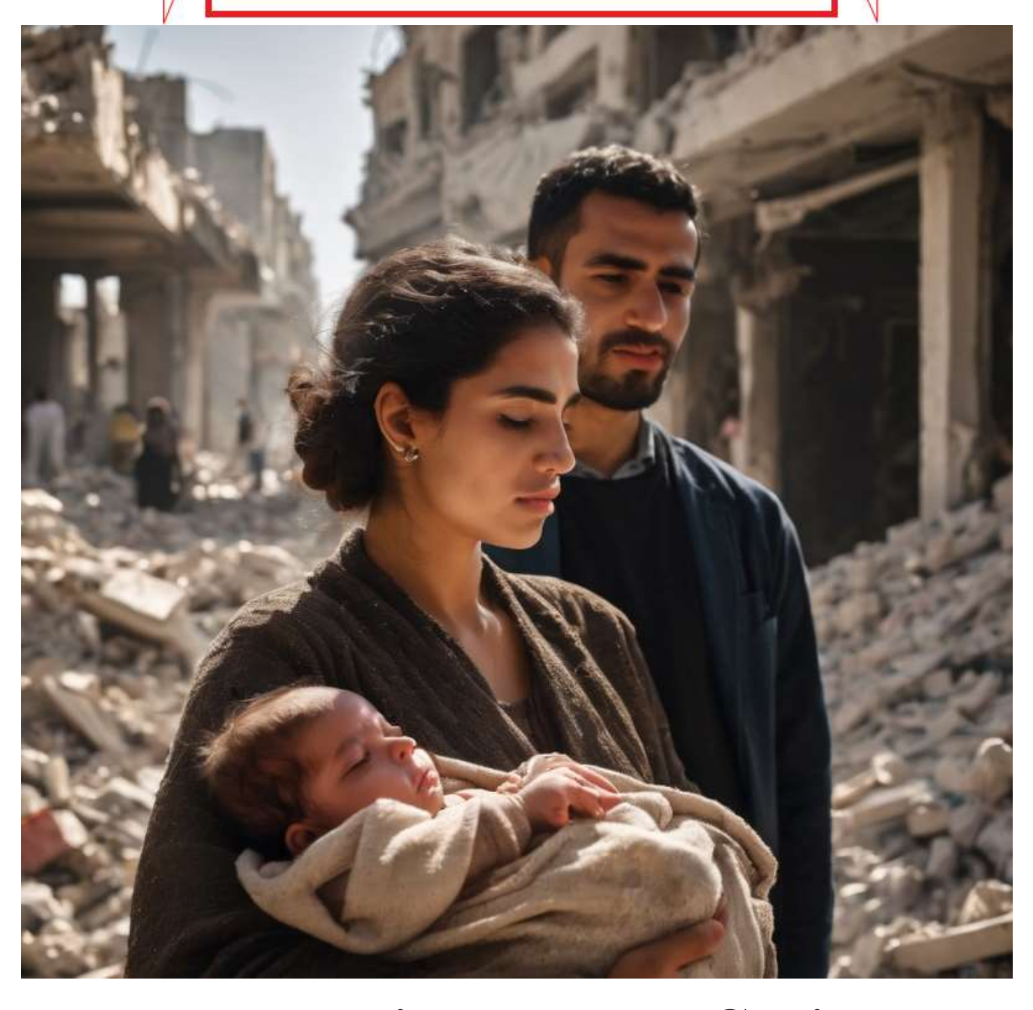
May Jesus bring peace at Christmas.