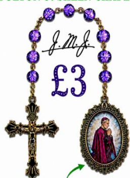
This unique medal was made in Northampton